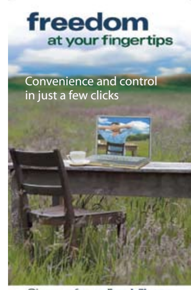
Sign up for online bill pay

No more checks to write, submit all your payments electronically with safety and security with every transaction.